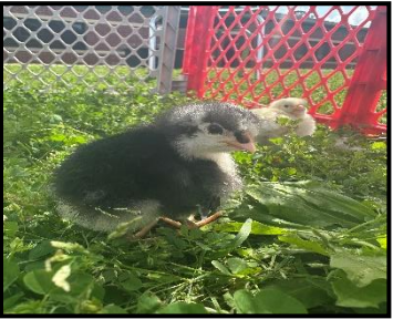
“Half & Half” as some of Fain's students call it, nestles in the grass

The agriculture class has a new flock of baby chicks, and they are adorable! There are around twenty chicks with more on the way. Each period has a different name for each chick that fits its character. There are black, brown, yellow, and multicolored chicks. The most popular chick has multiple names from different periods. Some names are: cinnamon, nugget, and butterscotch; he is a yellow brownish color with speckles of