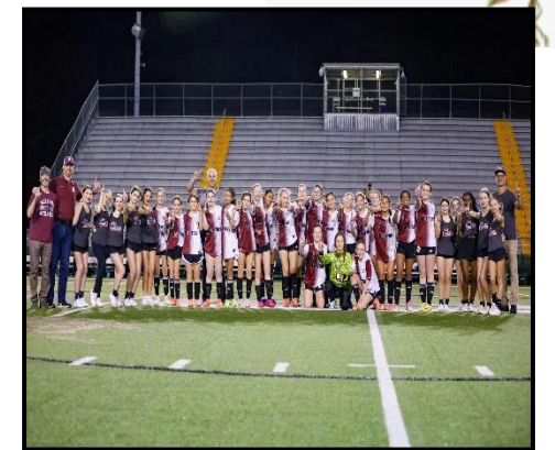
The 2025 girls’ soccer team poses with the Championship trophy